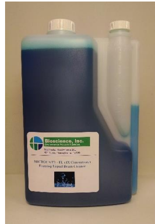
MICROCAT-FL 4X Concentrate